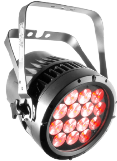
Color Wash Lights