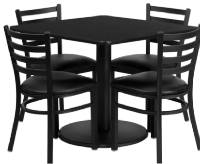
Table & Chairs