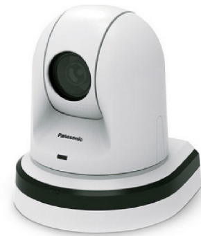
Point & Zoom Camera