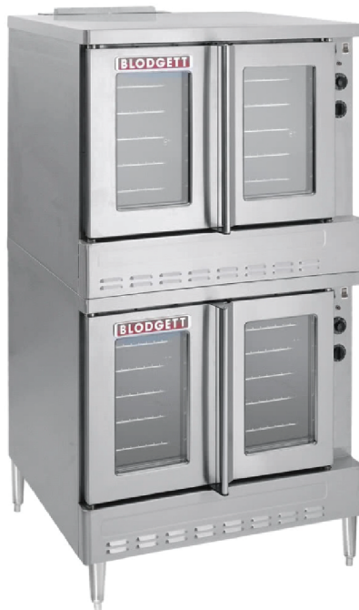
Commercial Warming Ovens