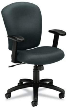
Conference Table Chair