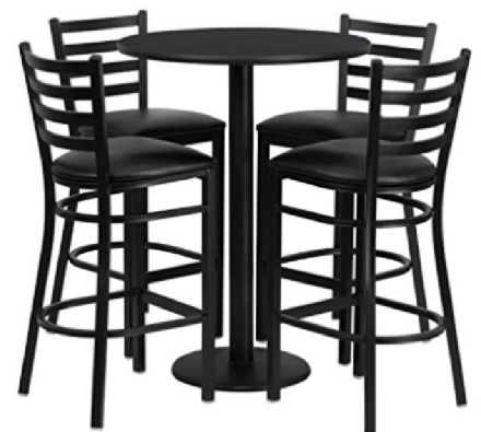
Table & Chairs