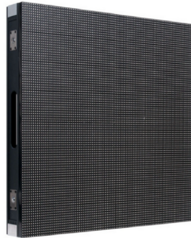
Panel of LED Wall